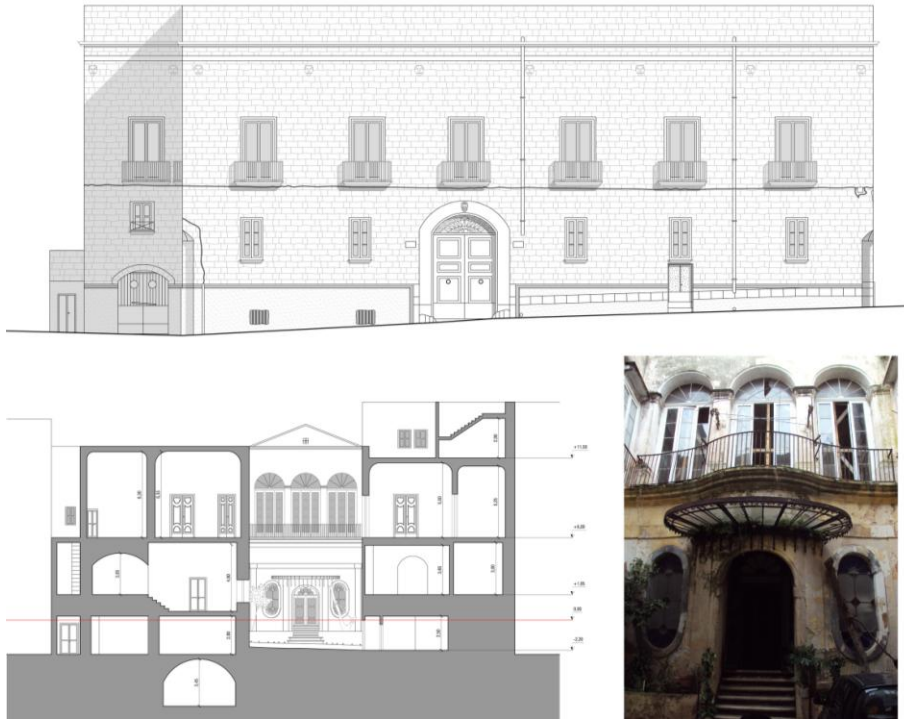
Figure 2: Front, section and picture of the courtyard of Carducci Palace (Arch. Occhinegro U.)

built some of the most valuable buildings like Pantaleo Palace, Amati Palace, Galeota Palace, Ciura Palace, d' Ayala Valva Palace, Carducci Arsenio Palace , Troylo Palace, Ulmo Palace, Gallo Palace (Figure). These buildings were erected on the tracks of existing structures and often were located over vast areas hypogean result of excavation, took place in Greek, Roman and Byzantine periods throughout the rock of the Acropolis: to raise the building material, was excavated the limestone (175,000 years of geological dating ) and were realized large underground rooms used in various ways over the centuries