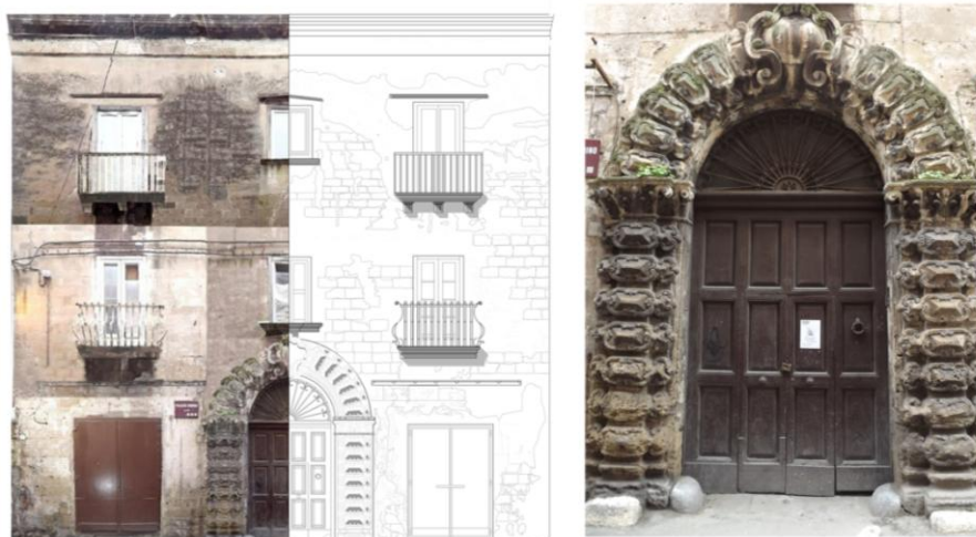
Figure 3: Front of Zigrino Palace (Arch. Occhinegro U.)

One of the most famous is the complex of underground rooms site under Palazzo Beaumont Bonelli Bellacicco. These significant transformations of urban space, determine the demolition of entire neighborhoods and the subsequent expulsion of the inhabitants, who were constricted to overpopulate the