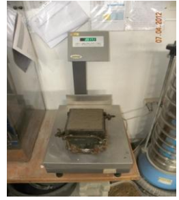
Figure 5: Mass of wet concrete