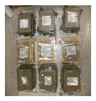
Figure 6: Maintenace of the samples [4]