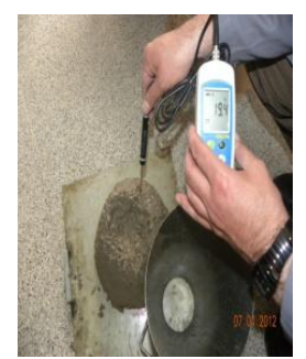
Figure 2: Temperature