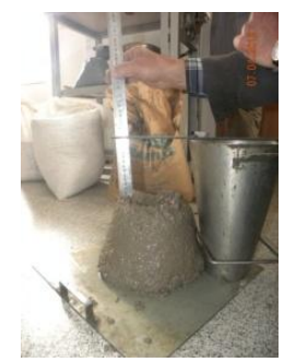
Figure 3: Consistency