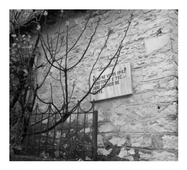
Figure 6: TEC workers have been on strike in 1942

For some properties, it is the association with certain people, events or aspects of the community that have value or interest, not the physical state. The industrial heritage is of social value as part of the record of the lives of ordinary men and women and as such it provides an important sense of identity. It is of technological and scientific value in the history of manufacturing, engineering, construction, and it may have considerable aesthetic value for the quality of its architecture, design or planning.