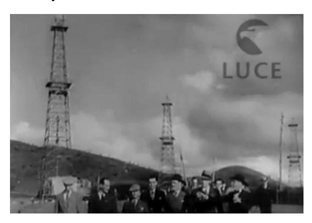
Figure 1: Borgo Galeazzo Ciano

After he controlled the area concluded that Kucova was a country with assets of oil. He made public this fact in 1918. Since 1918 to 1924, in many societies came for research in Kuçova as AIPA oil (petroleum Albania Azienda Italiana), an Anglo-Persian Oil Company and American French society etc... In 1928 in "Dikater" was drilled the first oil hole in Albania. From this moment onwards the city has been on oil drilling maps. Since 1928 until 1943, the Italian company AIPA had an agreement with the Zog I government that if the oil extraction would surpass 50,000 tonnes per year, this company would build a refinery in Albania. Even though the oil extracted was more than 170,000 ton, the refinery was never built and the oil was transported to Italy.