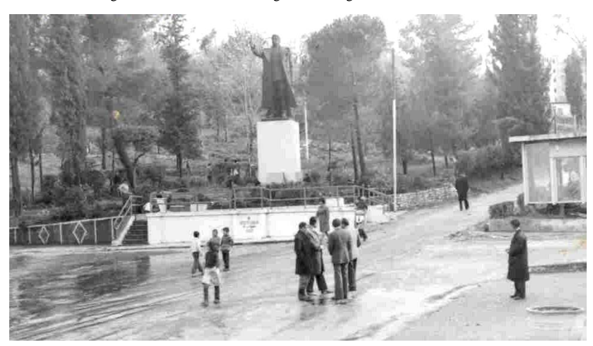
Figure 3: City Stalin

Kuçova has recognized the biggest development after the World War II, especially during 1975-1990. The population of the district in the late 1980s reached 32,000 by 6,400 residents that was in 1938. During Communist Albania the city was renamed to Stalin City (Albanian: Qyteti Stalin) and was a closed military district. The city was extensively developed in the 1950s and is of interest to students of communist architecture, although following the collapse of communism there has been much unauthorised building and modification to the original buildings.