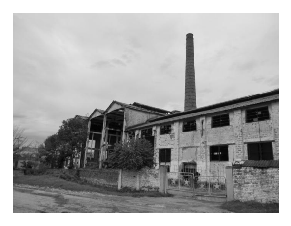
Figure 5: Electric central degradation.(physical state 7.4.2013)