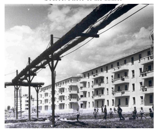
Figure 7. Coexistence between industry and residents