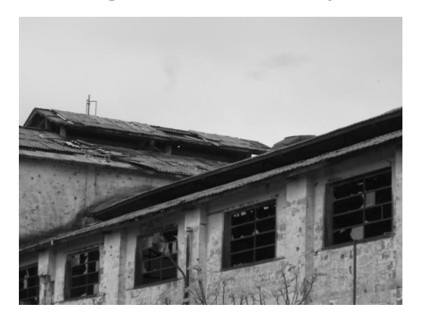
Figure 4 Electric central degradation.

Many of the industrial constructions in Albania have been abandoned for almost 20 years. We have two main kinds of interventions on the physical state: Time degradation, because most of them have been abandoned for almost 20 years and human intervention, because nearby inhabitants have physically damaged these buildings. As a result, many industrial heritage properties are found in a deteriorated state, but some others still maintain all or a part of their cultural heritage value or interest.