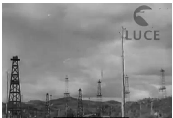
Figure 2: First oil drilling made by the Italian Petrolia Albania.company AIPA, Petrolia

Kuçova has recognized the biggest development after the World War II, especially during 1975-1990. The population of the district in the late 1980s reached 32,000 by 6,400 residents that was in 1938. During Communist Albania the city was renamed to Stalin City (Albanian: Qyteti Stalin) and was a closed military district. The city was extensively developed in the 1950s and is of interest to students of communist architecture, although following the collapse of communism there has been much unauthorised building and modification to the original buildings.