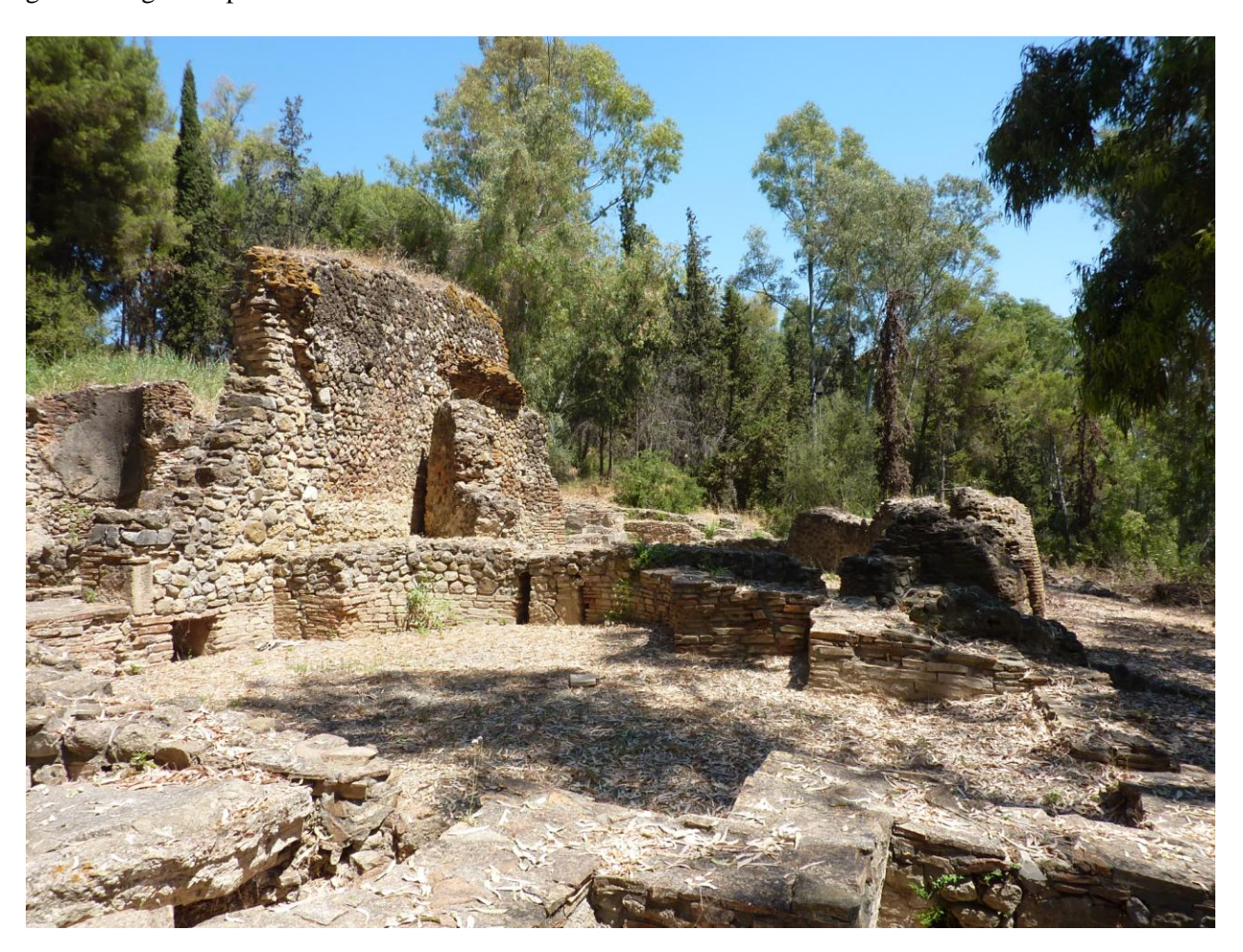
Figure 2: View of the archeological remains.

context, they become fundamental the drafting of a management plan, as well as the perimeter of the museum / archaeological park to the regional scale, within the existing planning instruments, which guarantee greater protection and enhancement.