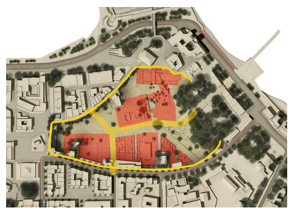
Figure 4: Kos. Plan of the archaeological site of Città Murata. Geometrical relationship between ancient structures and Italian project .

Moving from these assumptions a settlement of the area east of the park facing the entrance is suggested, this being based on an intervention of planimetric redesign of the square. Starting from the redesign of the green, now almost run wild, it is possible to redefine the spatial relations of the three churches within the large rectangle examined and locate internal paths, designed in continuity with the surrounding Italian style. There are no changes to the access structure, whose monument-type aspect is left to the routes inside the excavation and the square facing it. Within the archaeological area a redefinition of the areas of relevance to each ancient structure is planned through chromatic or particle- size treatments of the soil so as they can be read easily. A redesign of the paths made in stabilized soil is also envisaged.