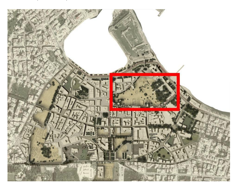
Figure 1: Kos. Plan of the city with an indication of the archaeological area of Città Murata (graphics processing M Cice., N. Dambrosio, based on the archaeological plan of Kos of G. Rocco and M. Livadiotti).

The aim of this paper is to analyse the Archaeological Park of Città Murata, a perfect example of its central role within the urban fabric and the great number of design solutions you can find within it. Among all the many urban areas subject to planning restrictions (Livadiotti, Rocco 2012), the Città Murata area, north of the town, near the harbour, takes on the extension of the intra moenia old quarter, destroyed by an earthquake in 1933, characterized by a typical medieval plant with small winding streets that cut a dense built-up area contained in a fairly regular perimeter, which follows the same pattern of the ancient paths in the broad sense of the word (Livadiotti).