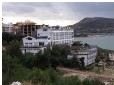
Figure 1: View of "Kampi i Punetoreve Saranda" before and after adaptation