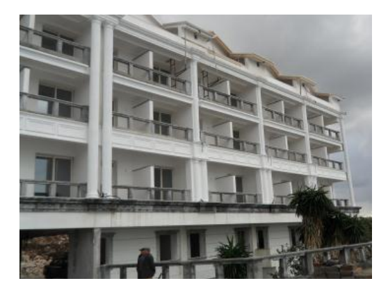
Figure 4: Photos of the Hotel after adaptation