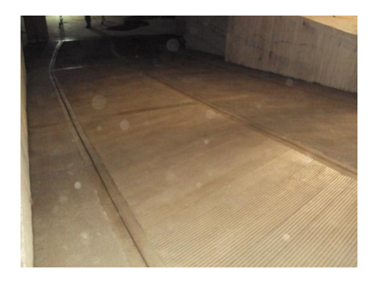
Figure 2.1.1: Ramp of Underground Parking

In this case can be mentioned the ramp of underground parking of a residential object built in Tirana, Albania, Figure.2.1.1