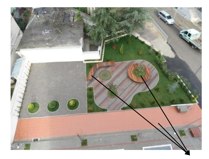
Fig 2.1.2.1: Relaxing Square. Industrial Concrete Layer, with Quartz

According to this method, this mixture is cast in situ, powered in precast shapes. As pointed below, surfaces are concepted in stripes with three colors. They are designed by the architect to create aesthetic element by combining stripes with squares and imiting nature colors. The square is not only beautiful but also has reached constructional requirements. Color additives used in this case are inorganic pigments because they do not fade. Use of resin is a eco friendly way, especially for relaxing areas, parks and playground because its porous composition makes the water to drain through and flow into the water table.