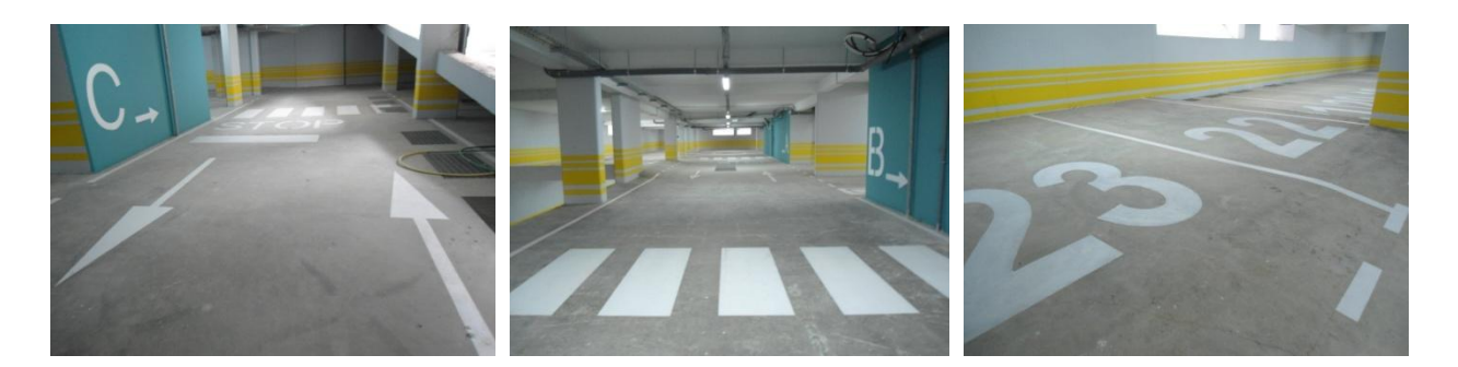
Figure 2.1.2.3: Parking area