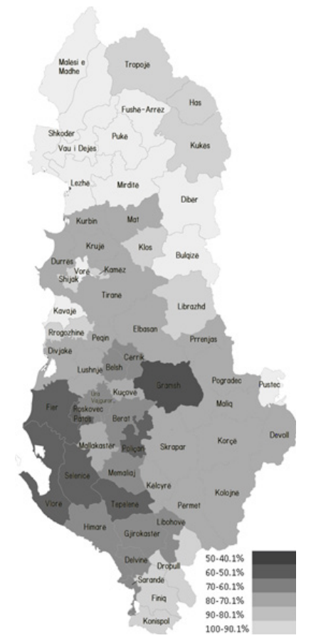
Figure 1. Distribution second local units, total of major religious traditional categories; Islam, Bektashi, Catholic, Orthodox, as percent of total respondents, Census 2011.