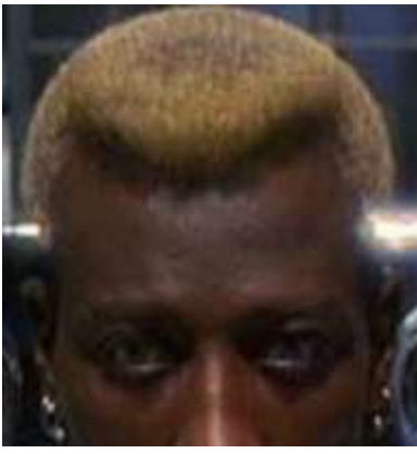
Fig. 4c Fig. 4d

The hairstyles and haircuts common among Lagos bus-conductors include galas, obama, afro, etc. In most cases, they have part of the hair cut while the other part is left grown. Some plait their hair, some make dreadlock while others just leave their hair bushy. Some apply relaxer to make their hair look like women's hair. Some also make hairstyles such as 'koko waves' or 'curls'. Some of these styles are shown in Figures 4 a, b and c. Some Lagos bus-conductors use dye on their hair. Some dye a small portion of their hair while some use dye on the whole hair. They use flashy colours such as gold, blue, wine, etc. The conductor in Figure 4d has his hair dyed and has earrings on his two ears.