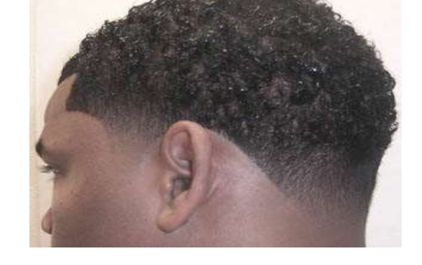
Fig. 4a Fig. 4b