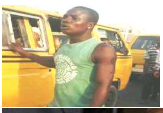
3.1.1. The Use of Tattoo Figure 2: A Conductor with tattoo and earring Figure 3: Painted Finger Nails with Bangles

Lagos bus-conductors often wear shirts or round-neck polos, covered with grime. Sometimes they have a small towel round their necks. They wear jeans to match and a pair of slippers, mostly bathroom slippers as portrayed in Figures 1a, b, c, d and e. Most of them often wear singlet on either black or blue jeans. The wearing of the singlet is partly because of the heat from the traffic congestion and the wearing of the blue or black jean is because of its ability to absorb dirt without being noticed that it is dirty. Sometimes they also put on shorts as shown in Figures 1d and e.