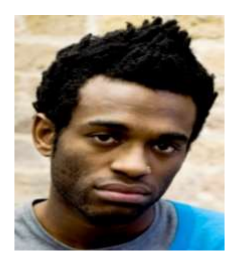
3.1.2. Hairstyle, Haircut and Colour of Hair Figure 4: (a, b, c and d) Hairstyles of Lagos Bus-Conductors

Most Lagos bus-conductors' nails are very dirty. This is because they intentionally leave their nails to grow long. Some have only the smallest finger's nails long while some others have all finger nails long. Some of the bus-conductors also have their nails painted as shown in Figure 3.