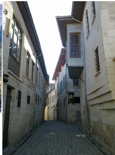
Fig 2. : A street from Gaziantep