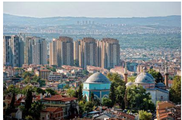
Fig 11.: City Center of Bursa

Municipalities of the cities have become an annuity gate by globalisation. These authorities were imposed in recent years as competing business with each other in terms of land rent. Buildings were constructed to generate income without attention to features, eliminate the identity that reflects different characters of each region, away of being similar.