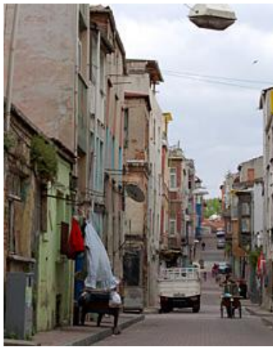
Fig 8.: Old Sulukule District

This project was set out to improve the ruins in the region of the city. However, the project asked people living in these district, for additional people who didn't pay this fee, left the region or settled the region was chosen by the municipality where is miles and miles away from the original settlement. Traditional building district was ruined generally; and then after the identity of the region was lost, the region was