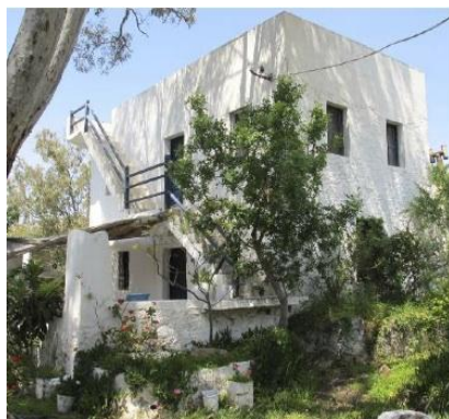
Fig 4. : Traditional Bodrum House

Urban culture is also linked to the physical structure. As long as cities communicate with different cities. They are affected by different cultures and different structures, and they can develop, upon these differences the cities which have cultural interaction, are usually similar to each other. Bodrum is one of the best examples in this subject. This town is surrounded by mountains so it didn't have cultural interaction with surrounding cities and developed differently. The construction method of cities around Bodrum were similar, but construction type of traditional Bodrum houses are similar to the Greek Island's construction method (Fig 4 and 5). Because Bodrum is a coastal town and has cultural exchange with Greek Islands.