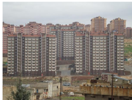
Fig 13.: A group of building from Gaziantep

The process of globalization threatens the urban identity and forcing all cities to be similar. In the past, each city was constructed according to characteristics and features, and had its own identity. However, today, in every city the same types of projects are applied, and they cannot be distinguished from each others. If the current type of building production continues in the future, a city the concept of identity will eradicate.