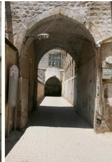
Fig 3. : Kabaltı

Figure 3 show a shaded area by over street house (called Kabaltı) in the streets. The Kabaltı creates wind corridor to cool streets in summer hot days.