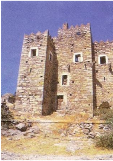
Fig 6: Tower house in Bodrum

constructed outside of the house and window were very small to prevent of pirate attacks, only two beam were constructed for portable stairs (Fig 6). In this town, urban dwellers shaped their structures on which they had learned throughout the history.