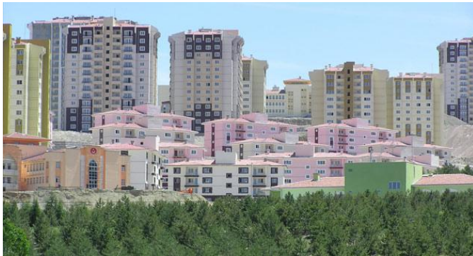
Fig 12.: A group of building from Bursa

As in case of Gaziantep and Bursa, the cities have two different climates but similar type of project implementation (Fig 12 & 13) that these projects are not appropriate to the characters of the cities.