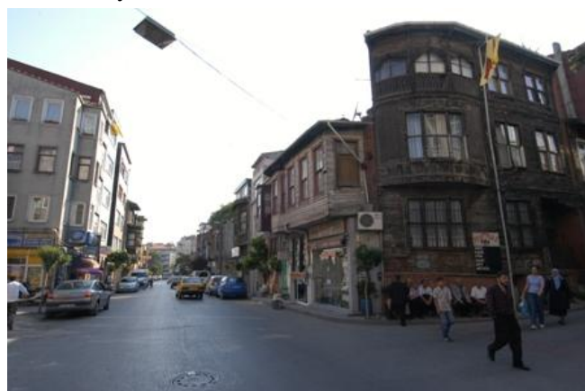
Fig 21.: İmrahor İlyas Bey Avenue