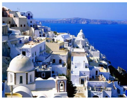
Fig 5. : Santorini Island

Cross- cultural interaction provides a new structure of environment by imitating the other cultures. The less developed societies and cultures are affected by developed societies and cultures (Tarde,1903). Thus, the cultural interaction caused changes in the social structure changes and urban identity.