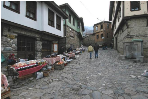
Fig 10.: Bursa-Cumalıkızık

Globalization process overcomes successfully the city and its identity and values. Urban dwellers that are living in such city, have embraced natural, cultural, architectural values of the city and have worked on these values to be common values. As an example of Bursa-Cumalıkızık, (Fig 10) locality in the village, traditionalism and conservation values were transformed to economic values as tourism, therefore all traditional houses were conserved and people continued to live in their village, then after the region became attractive for tourism activities. Thus, Cumalıkızık overcomes the effects of globalization without losing its identity. Consequently the region preserved its identity against the globalization process far from the city center and industrial areas.