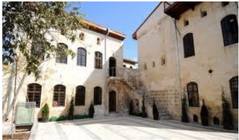
Fig 7.:A courtyard from Gaziantep House

The population structure is another factor affecting socio-cultural structure of the city. According to literacy rate and distribution of age, city can be formed; for example; if geriatric population is more, social spaces in the city should be suitable for this age group.