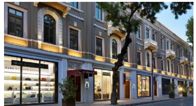
Fig 18.:New Akaretler District in İstanbul

Nowadays this area gained the highest economic values in terms of rent. After the restoration of these row houses, the functions of hotel, business center, café and restaurant were loaded. Akaretler has become one of