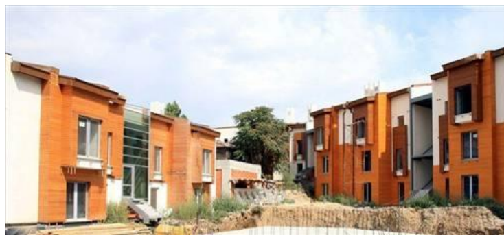
Fig 9.: New Sulukule District

transformed into unqualified area where new villas were built. (Fig 9).