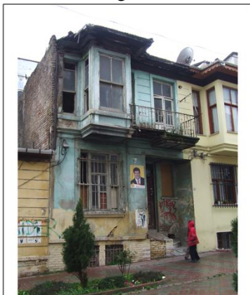
Fig 20.: Masonry building in Yedikule

In some periods after the big fires occurred in İstanbul, the wooden architecture was replaced by masonry architecture with the law in 1957. The number of masonry building were increased instead of wooden houses. (Fig 20). Thus, the district started to change in this period, the existance of train station and gas factory were effective figures in the changing of urban identity.