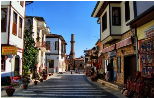
Fig 16.: Kale İçi District in Antalya

The new functions, which are introduced in the historic towns, lead totally to change in the lifestyle of city dwellers. For example; some historical towns, which were used as residential area, transformed tourism areas, thus historical regions were preserved.