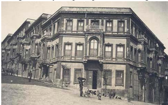
Fig 17.: Old Akaretler District in İstanbul

In the past, historical towns were known as residential or cemmrcial area. But as a result of economic, social and cultural changes, they were transformed in to different functions, which led to change the perception of the city. For example; row houses Beşiktaş, Akaretler (in İstanbul) were designed as Dolmabahçe Palace dwellings (Fig. 17). Although the row houses in Akaretler preserved the function of residence, city dwellers changed totally the perception of this region changed.