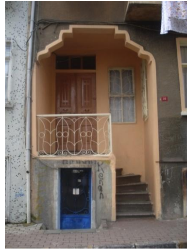
Fig 18&19.: Entrance of Yedikule Houses

When the district is studied in terms of physical structure, the houses were built up vertically against the slope. This planning type is located on the sloping the streets are slopping facing the sea. The stairs were used for the entrance of the house and laid on the slope. (Fig 18&19). Topography was not important so much to form the Yedikule District. The only effect of the topography is the slopy streets.