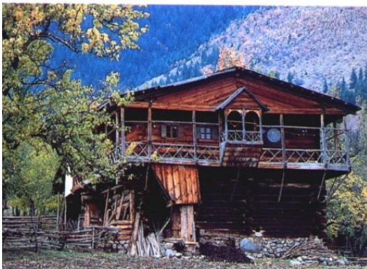
Fig 1. : Artvin House

Whereas houses in Gaziantep houses were built on flat plain land. This city is by hot climate which characterized, had direct effect on it's urban housing design; the streets are very narrow and house-courtyard walls remains in shade behind high walls (Fig.2).