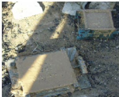
Figure 1. Molding of mortars

Concretes without cement were individually prepared with each sand type by using 33, 3% PE in weight. In material production, PEs was firstly molten at approximately 200 °C. After desired viscosity was obtained, each sand was mixed with viscous PE molten in different containers. It was tried to provide optimum homogeneity during heating. These different mortars were poured into 4x4x16 cm and 10*10*10 cm molds (Figs.1–3).