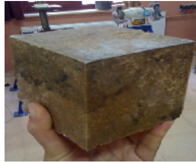
Figure 3. 10x10x10 cm specimens

Concrete mortars were produced by mixing sands with same quantities. Water-cement ratio was 0, 5 in weight. Compression strengths of these specimens were measured after curing them during 28 days. Abrasion and absorption values were also obtained.