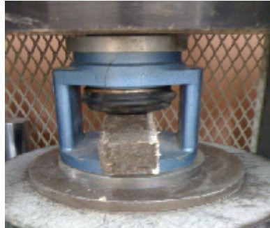
Figure 4. Compression Strength Test

Concrete specimens are used for obtaining amount of load per unit area and observing behaviors of concretes produced with these mortars. These technical data give ideas about practical applications. Compression strengths of these hardened plastic concrete specimens were tested with uniaxial compression testing device (Fig. 4). Results are given in Table 5.