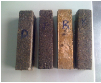
Figure 2. 4x4x16 cm specimens