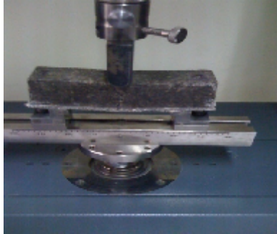
Fig. 5. Bending Strength Test

Bending strengths of hardened plastic concrete specimens are measured with one-point bending test device (Fig. 6). Test results are shown in Table 6 and Figure 5.