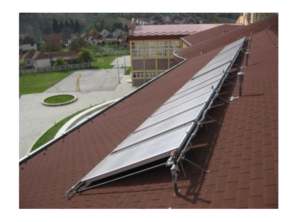
Figure 2: Solar system of High School of Food and Hospitality in Cacak, Serbia (Dragićević, Plazinić, & Jovanović, 2011)

The project consists of two parts. The first part encompasses the installation of solar panels for the purpose of using alternative energy sources in the city of Čačak. The first installation was set up in the Food and Catering School, being consisted of 40 m<sup>2</sup> highly selective flat plate collectors that heat up to 2 m<sup>3</sup> of sanitary water per day. (Dragicevic, et al., 2011) The entire assembly is controlled automatically which, in addition to the controlling function, has a measuring role as well. There are two devices set up on the system, one for measuring the consumption of sanitary water and another one, used for measuring the amount of thermal energy produced by the system (Mitrovic, 2010).