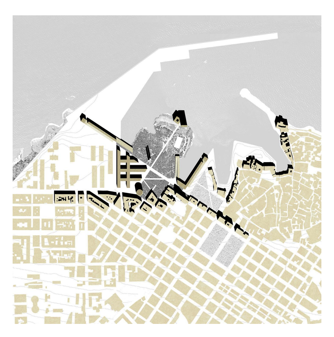
Figure 4: Planovolumetric

The context is that of the city of Monopoli, a medium-sized coastal city, located at south of Bari. The area in question is that of the abandoned cement factory located on the largest of the three "peninsulas" that articulate the coastline enclosed within the harbor basin, between the outer and inner breakwaters. In turn, these two piers are grafted to the two external "peninsulas", one of which is occupied by the oldest part of the city and by the castle of Charles V, built on its point.