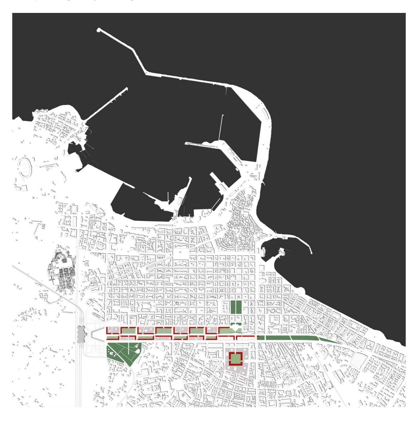
Figure 1: Masterplan

The urban "islands", recognizable by their unity and completeness, together with the elementary units that compose them, register with their forms (the towers, the loggias, the orders of the openings of the facades, etc..) and their variations the peculiarity of the places that they build and on which they overlook (crosses, squares, green spaces). Their morphological articulation combines the continuity and compactness of the consolidated city with a volumetric density adequate to the creation of new places for the city, corresponding to the aspirations of our time.