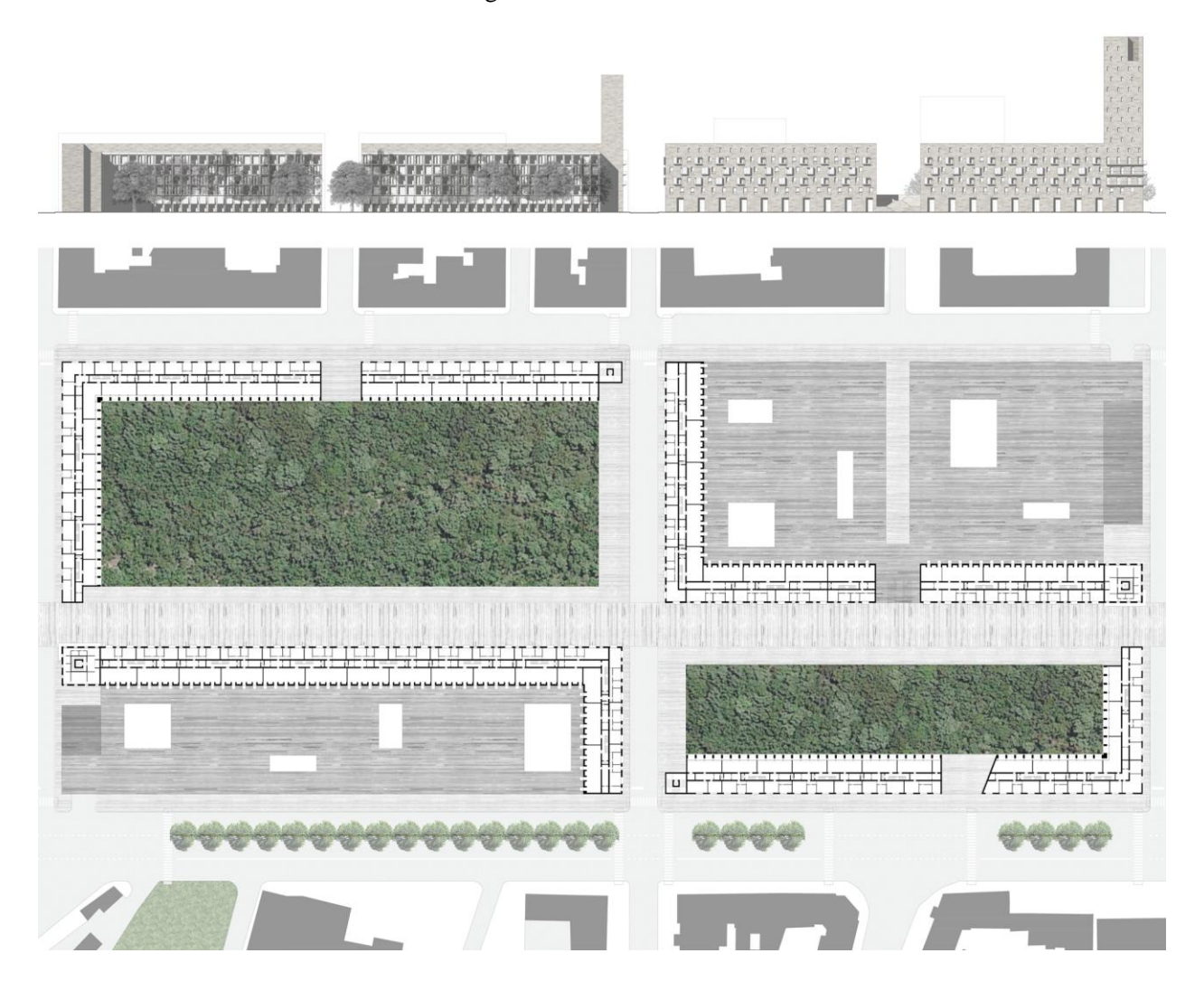
Figure 3: The urban unit. Plan and elevation on the central pedestrian boulevard