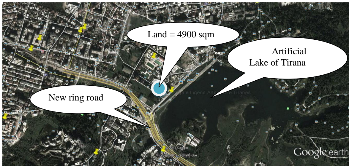
Figure 1: Aerial photo of the land location

Case 1. A land area of 4900 sqm, part of Cadastral Zone No.8270, is located on the southwest of Tirana Artificial Lake (Figure 1). This piece of land is located within the sub-structural unit 5-33 of urban study of Tirana City (Figure 2). Local detailed plan for this piece of land provides a 35% utilization coefficient and on it can be built 9, 10,11,12,13 and 14 story building composed by shops and apartments (Figure 2).