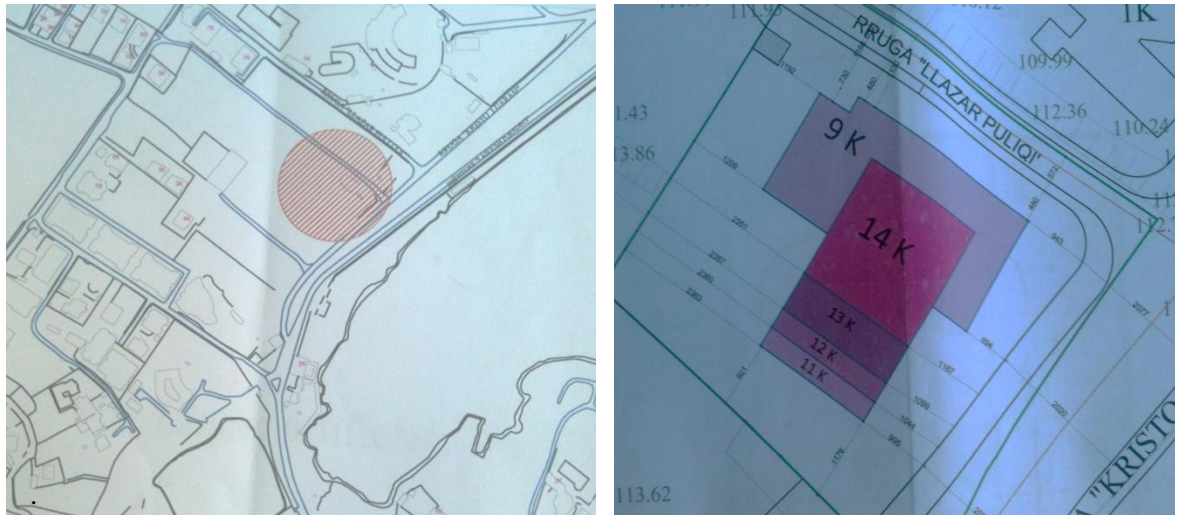
Figure 2. Land location on the map and land detailed plan

Land surface = 4 900 sqm Building area = 10 317 sqm Ground floor area (shops) = 1 170 m 2 Market value of shops = 2 500 Eur/m 2 Market value of apartments = 900-1200 Eur/m 2