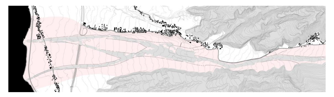
Figure 2: Valanidi Stream, Map of the constitutive elements of the landscape. (Author)

background and will constitute, as well as evidence of the design process, a means to make intelligible the design choices and facilitate the assimilation of the new landscape.