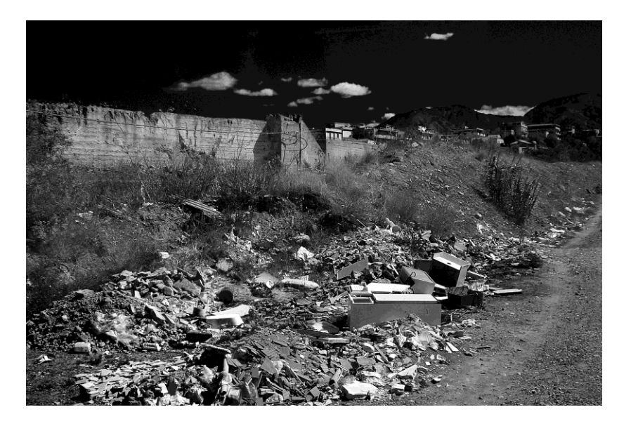
Figure 1: Reggio Calabria: The Valanidi Stream.

Riverscapes are ascribable in this category. Water courses of different sizes and flows, are still shaping the landscape by digging, eroding and transporting, meandering with unpredictable variations. Their role was fundamental into the civilization process and, during the ages, the objective of their control and use has led the man to struggle to subvert their natural order; with results that however are still showing deep uncertainty. (Middleton, 2012).