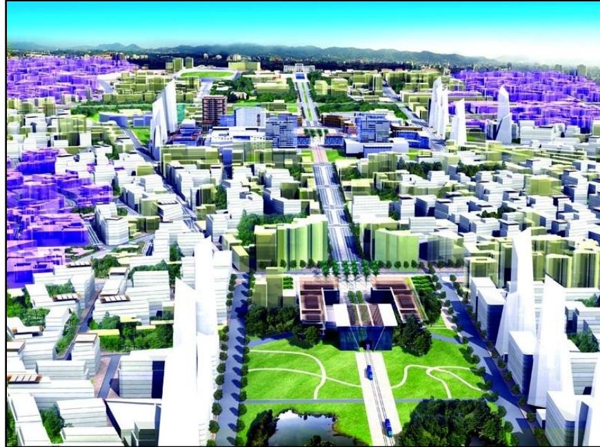
Figure 8: A Perspective from the winning project for the Master Plan of Tirana, where the high rise towers engulf the historical city center