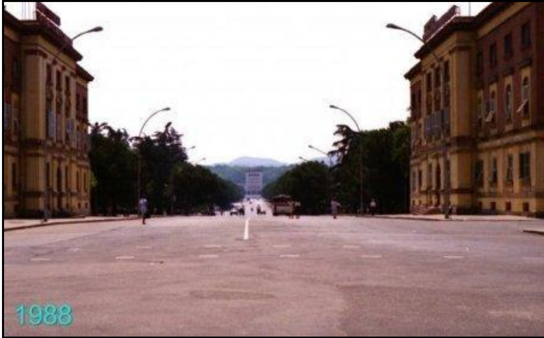
Figure 5: A view of Boulevard “Deshmoret e Kombit” where the Tirana Polytechnic University Main Building (Ex House of Fascio) is focused in the perspective taken in 1988, ( www.argophilia.com , accessed in 20/04/2012)