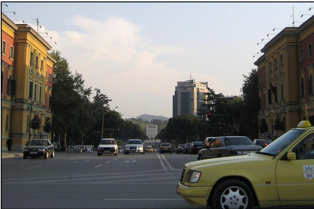
Figure 6: The same view taken after the building of Twin Towers 2005, showing the visual effect it makes to the boulevard, ( http://www.flickr.com , accessed in 20/04/2012)