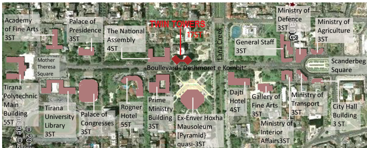
Figure 4: The Aerial View of Main Boulevard of Tirana, the Buildings with the proper storey height and the position of Twin Towers within it