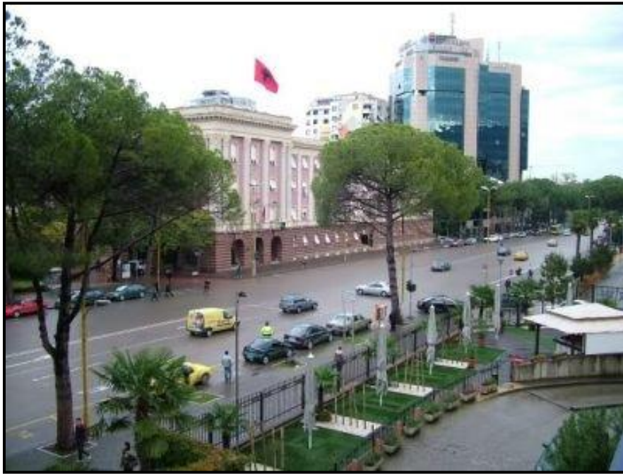
Figure 7: The Twin Towers and The Assembly Building on its left, ( http://abcnews.al ) , accessed in 20/04/2012)

focusing Tirana Polytechnic Main Building. Buildings organized in groups can be denoted as “meaning” of Genius Loci, which is explained with the key word gathering. The same language used in the design of the governmental buildings is like an invisible relationship between them. This is the relationship that is defined as the “structure” of Genius Loci. All of the elements defined above as elements of Genius Loci are part of a Totality. Within this ensemble of governmental buildings the Twin Tower does not have the same design language and is not positioned within a group of the other buildings, so it doesn’t contain features of the same Genius Loci.