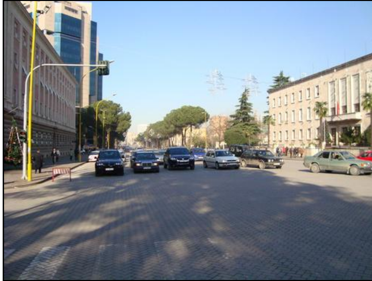
Figure 3: The main boulevard of Tirana, Prime Ministry in the right, the Assembly (Kuvendi) and Twin Towers in the left side, (www.panoramio.com, accessed in 20/04/2012)