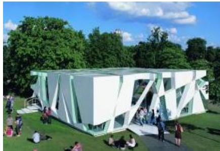
Figure 1: Serpentine Gallery Pavilion, 2002.

Japan) in 2007. While designing these three buildings, Ito followed the same methodology with three different materials. These examples offer proof that temporary architectural practices can serve to experience new methods and inspire the architect to design future works based on the same methods.