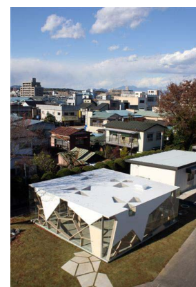
Figure 3: Sumika Pavilion, 2007.

The definition of the term temporality in architecture is related mainly to the lifespan of the structure, which is quite short in the case of pavilions. On this subject, Moisés Puente claims that the temporary structures have died young, and that their temporary existence does not permit the passage of years 2 . Although there is an inherent downside to the short lifespan of temporary architecture, there are compelling advantages that transcend their period of existence, their impact can be long lasting, they create a memory of architectural practice, project the power of focus, perception, construction, and their inevitable destruction forms a part of their relevance. Moreover, the power of the experience of a pavilion lends importance to its evaluation and effect, as well as its meanings, thereby diminishing the relevance of its temporary nature.