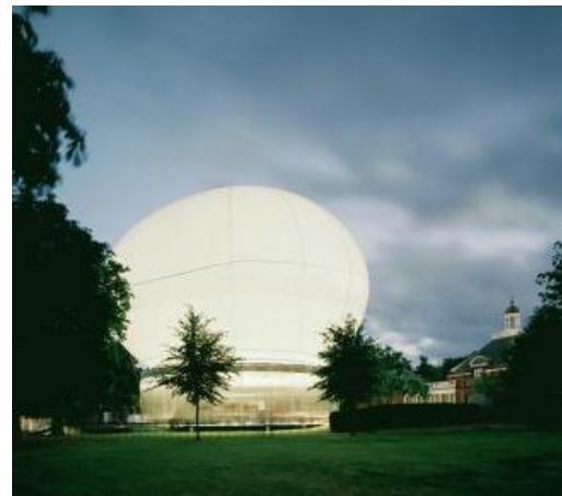
Figure 5: Serpentine Pavilion, 2006. Source: OMA