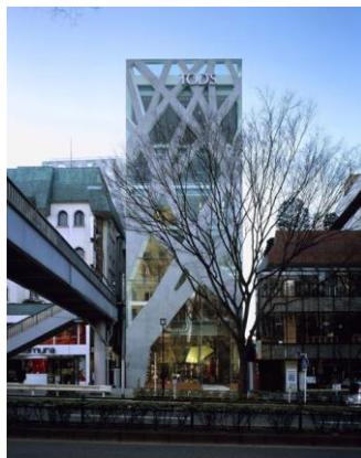
Figure 2: TOD'S Omotesando Building, 2004.