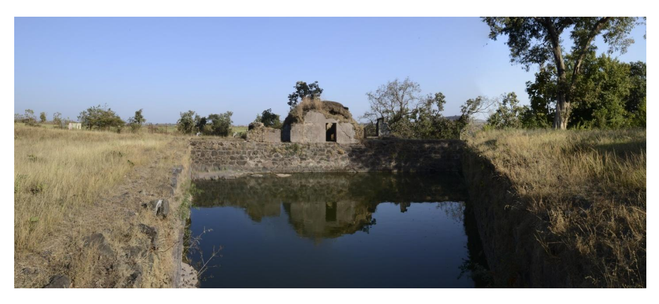
Figure 4: Lal Mahal. Domed pavilion on the eastern retaining wall of the garden tank of the complex. (Photo by Fabrizia Dragone. February 2014)