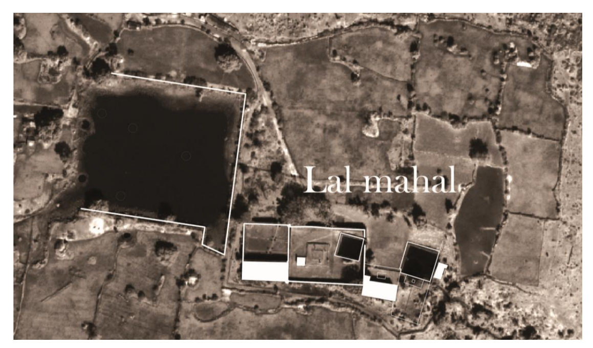
Figure 1: Lal Mahal. Site plan showing the complex and the adjacent big artificial basin exploiting the natural spring located on it south-western corner. On the easternmost side a dam controls the water storage from a further spring. Fields of wheat surround nowadays the architecture

By the left and western side of the architectural compound stands a large squared water basin some about 1,7 ha in surface, artificially designed by massive stone walls on three sides and providing water to the agricultural fields of the area (Figure 1). Size and shape of the stone blocks, some about 100x40x40 cm, suggest that the structures could be related to an era previous to the Khalji, since no one of the Muslim buildings shows such an impressive size of the building construction elements. Nowadays a stone well is dug on the water basin bed in order to get water during the post-monsoon time when the water level into the lake goes down up to be completely dry. Water ponds are also dug into the impermeable terrain to provide temporary water storage.