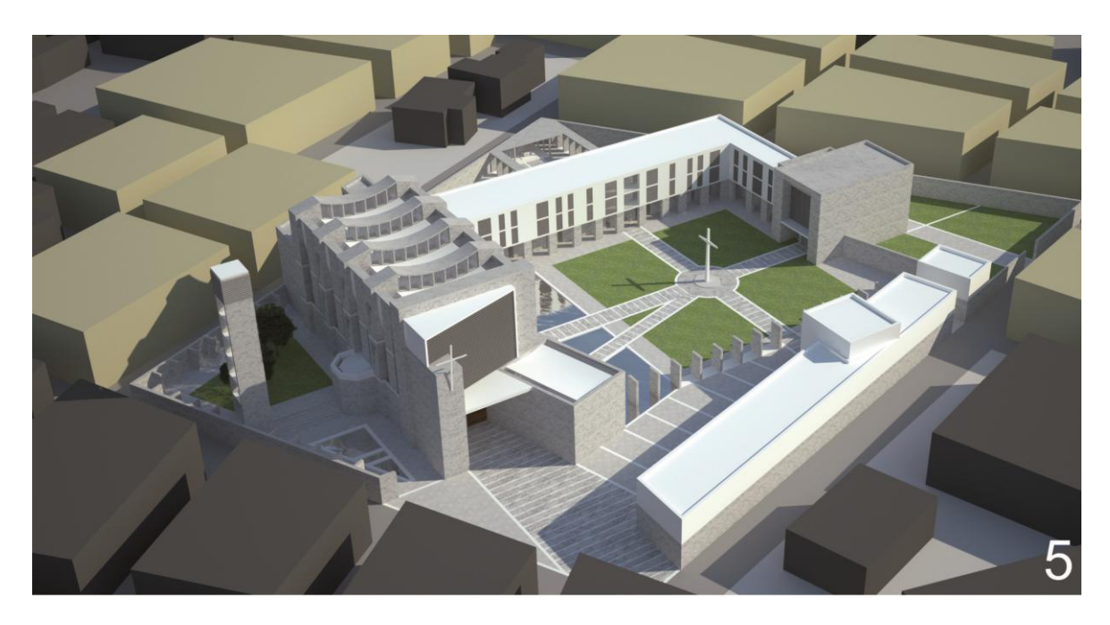
Figure 5: Project in Corato, stud. I. Di Gennaro