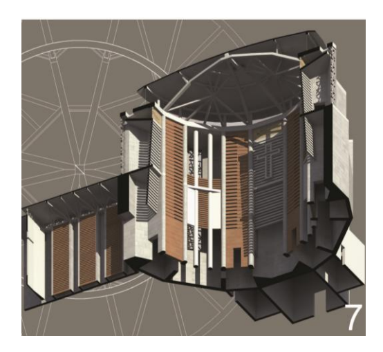
Figure 7: Project in Corato, stud. M. D'Aprile