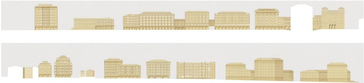
Figure 2: Corso del Popolo's facades: a modern reinterpretation of the traditional architectural language

To the definition of the architectural character of the each building matches a rigorous research on how building types correspond to a preordained logic of aggregation within the urban space.