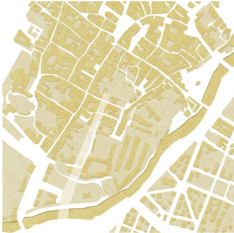
Figure 1: the city centre with the profile of the new road

At the beginning of the 20th Century this area was mainly occupied by plots with few buildings onto it, gardens, inner street Figure 1.