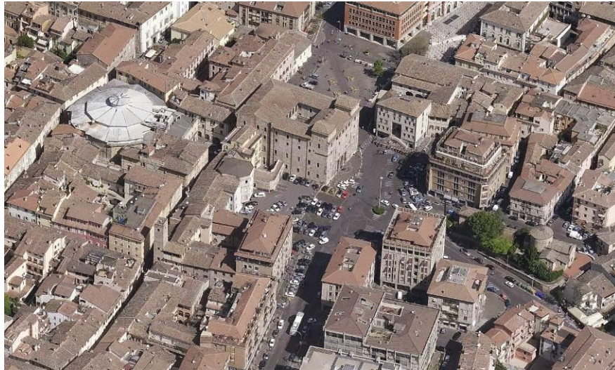
Figure 5: aerial view that shows the relationship between the historical urban fabric and the post war buildings 9

On one hand Piazza Ridolfi (Figure 5) represents the expressive accumulation site of Ridolfi's work in Terni, constructed through the dialogue between his most important architectures and the monuments which symbolize Ternian civic identity: Palazzo Spada and the Tempietto del Sole .