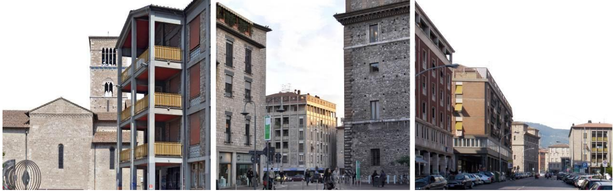
Figure 2: views of the most significant realisations by Ridolfi and his Studio: his idea of modernity stands in closer but critical dialogue with the historical monuments

Hence derives the primary theme of the coordinated relationship between the urban historical structure and the regeneration and expansion's strategy based on the recognition of the authentic values of tradition and of those of continuity with it.