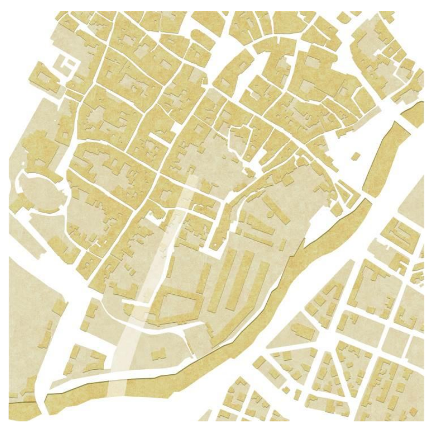
Figure 1: the city centre with the profile of the new road

At the beginning of the 20th Century this area was mainly occupied by plots with few buildings onto it, gardens, inner street Figure 1.