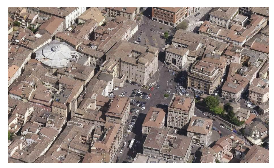
Figure 5: aerial view that shows the relationship between the historical urban fabric and the post war buildings<sup>9</sup>

On one hand Piazza Ridolfi (Figure 5) represents the expressive accumulation site of Ridolfi's work in Terni, constructed through the dialogue between his most important architectures and the monuments which symbolize Ternian civic identity: Palazzo Spada and the Tempietto del Sole .