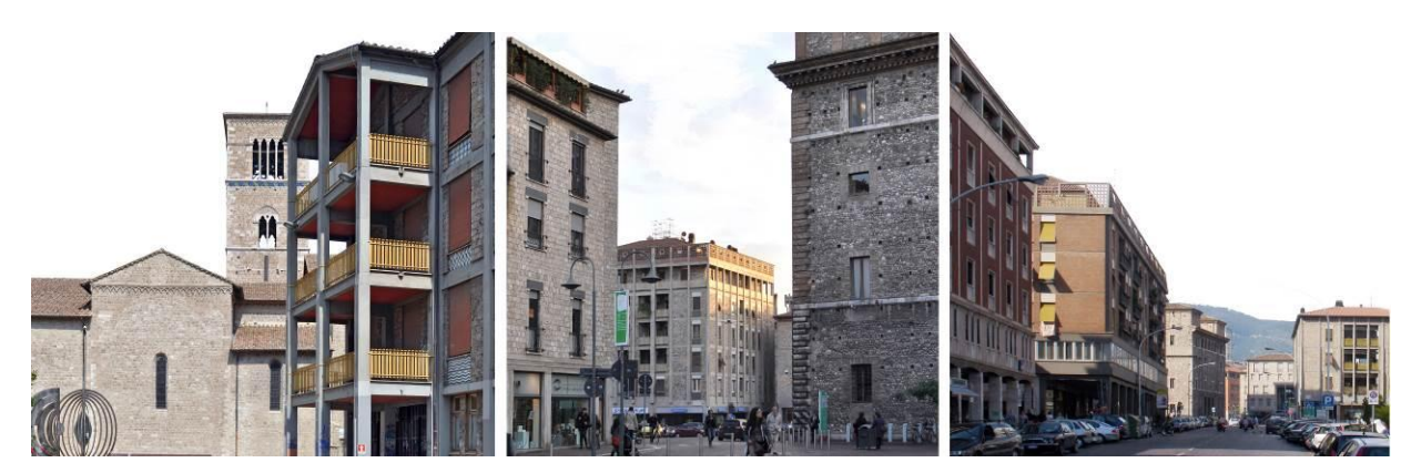
Figure 2: views of the most significant realisations by Ridolfi and his Studio: his idea of modernity stands in closer but critical dialogue with the historical monuments

Hence derives the primary theme of the coordinated relationship between the urban historical structure and the regeneration and expansion's strategy based on the recognition of the authentic values of tradition and of those of continuity with it.