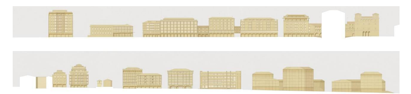
Figure 2: Corso del Popolo's facades: a modern reinterpretation of the traditional architectural language

To the definition of the architectural character of the each building matches a rigorous research on how building types correspond to a preordained logic of aggregation within the urban space.