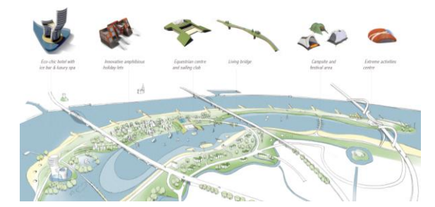
Figure 1: Baca Architects, Eiland Veur Lent, Nijmegen, The Netherlands, ongoing

"Defend" involves the construction of engineered defence infrastructures to stop water entering the existing built environment, which could host also other functions, public or commercial, benefiting from the water proximity and leaving the protected zones behind for public recreational spaces. The Eiland Veur Lent project in Nijmegen, The Netherlands (Web-1), currently under construction, includes a major dyke relocation and new flood-relief channel to reduce flood-risk and support urban growth in Lent. Baca Architects were invited to draw-up plans for an integrated solution which proposes on the artificial island water recreation, river ecology, flood-resilient development and sustainable infrastructure to create a self-sufficient 'eco-leisure' destination in continuity with the landscaped surroundings.