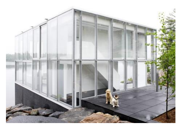
Figure 8: Studio gh3, Studio Apartment for a photographer, Lake Ontario, Toronto, Canada, 2012

Another interesting opportunity for water architecture, exploiting the thermal mass property in an active way, is deep water source cooling and heating which use water as a heat source in winter and a heat sink in summer, with the aid of a heat pump to transfer thermal energy from and to the adjacent water mass. In the studio apartment and boathouse for a photographer, Lake Ontario, Toronto, Canada (Web-9), the architectural firm Studio gh3 take advantage of the lakefront site not only for the panoramic views of the setting but also for the deep-water exchange to heat and cool the building year–round through radiant slabs and recessed perimeter louvers at the floor and ceiling.